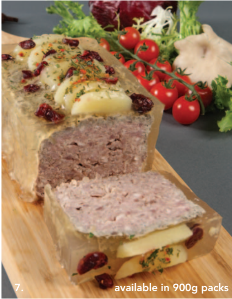
7. available in 900g packs