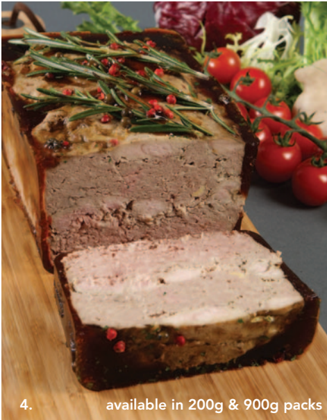
4. available in 200g & 900g packs