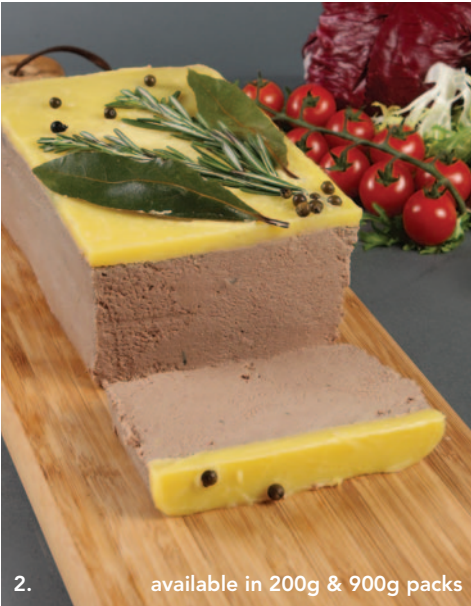
2. available in 200g & 900g packs