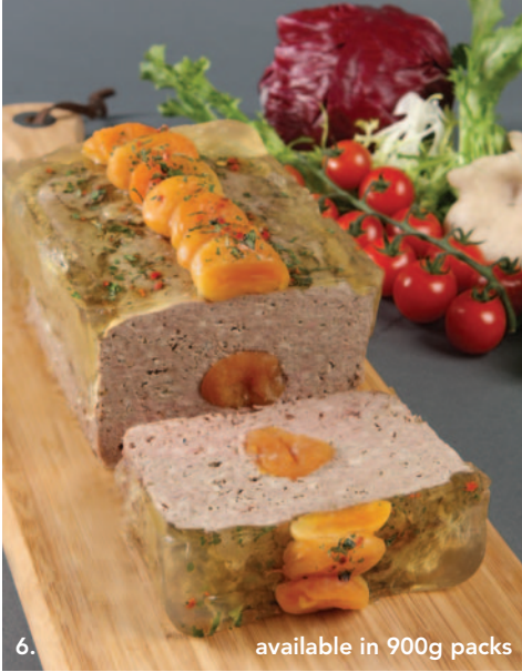
6. available in 900g packs