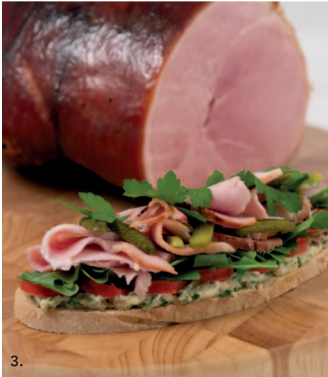
1. Alderton™ Ham marmalade glazed £35-£98 / 2. Maplebeck Ham unadulterated plain perfection £30-£93 / 3. Sherwood Ham smokey and succulent £30-£93 / 4. Victuallers Ham orange and stout £30-£93 / 5. Clumber Ham honey and cloves £30-£93

More ham details and prices can be found at: thecountryvictualler.co.uk