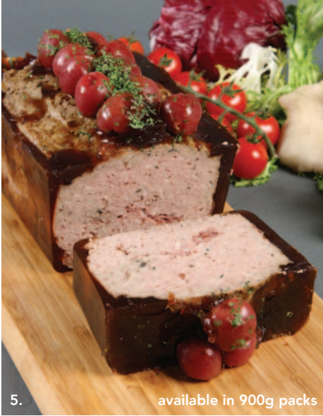
5. available in 900g packs

1. Smoked Salmon Pâté 200g £5.75 ~ 900g £19.50 / 2. Chicken Liver Pâté with brandy 200g £5.75 ~ 900g £19.50 / 3. Duck Liver & Gammon Terrine 200g £5.75 ~ 900g £19.50 / 4. Pork & Pheasant Terrine 900g £19.50 / 5. Pork & Venison Pâté 900g £19.50 / 6. Terrine de Campagne a coarse pork pâté with nutmeg 900g £19.50 / 7. Pork & Wild Boar with Juniper Berries 900g £19.50