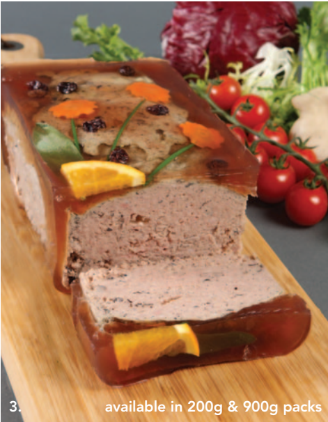
3. available in 200g & 900g packs